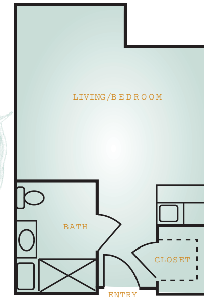
ONE BEDROOM • 650 SQUARE FEET